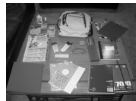
Every backpack was filled with needed school supplies