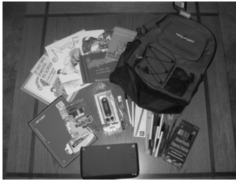
A Brooke Pack and supplies for our youngest Recipients