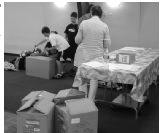
Packing and shipping at Temple Beth El