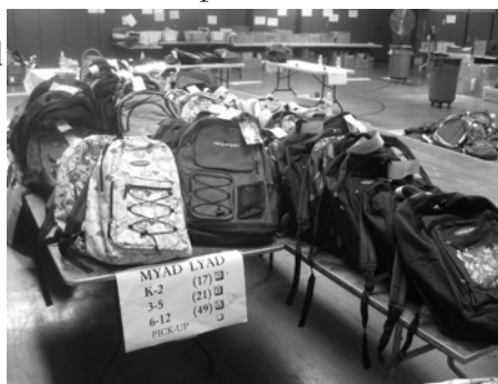
Backpacks ready for pickup at Solomon Schechter